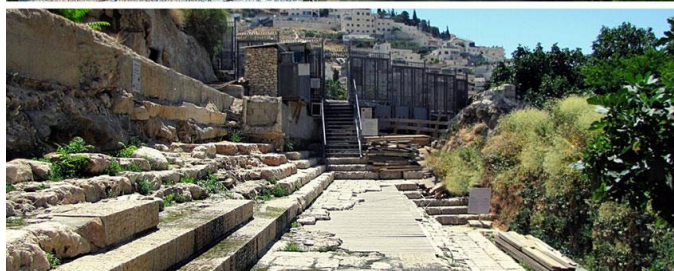
The recently discovered Pool of Siloam