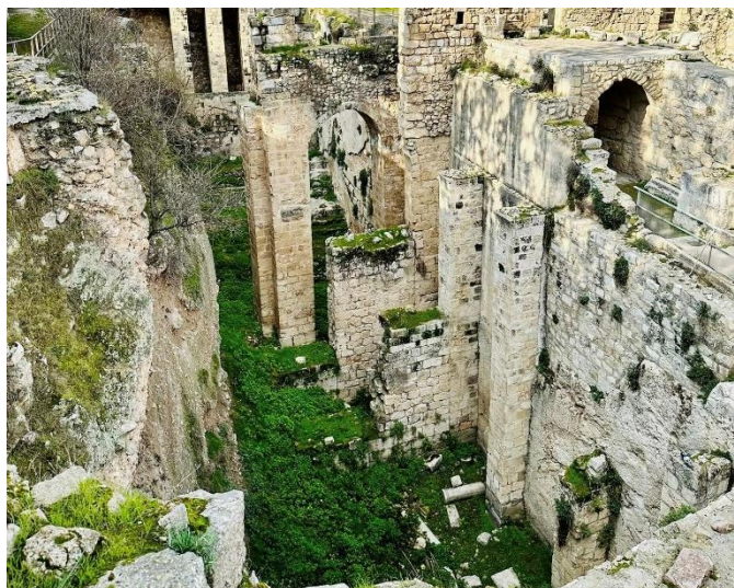
Ruins of the middle porch of the Pool of Bethesda

Take a brief walk along the Via Dolorosa (the way of suffering) and then pass by the Antonia Fortress (Ecce Homo) where Jesus was brought before Pontius Pilate (Luke 23:1-11). You will visit the Christian Quarter and the Church of the Holy Sepulcher .