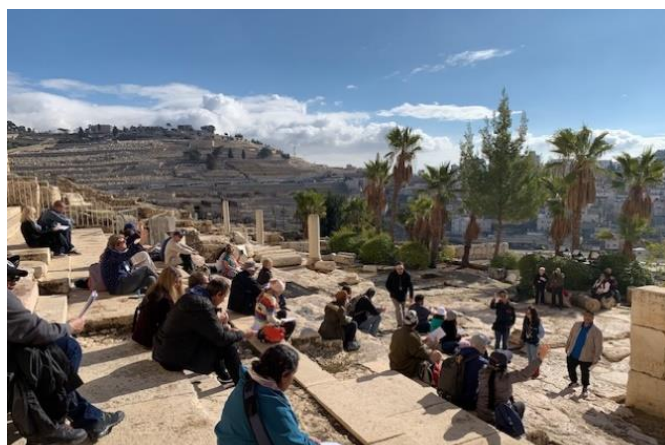
The Southern Steps with Mt of Olives in background

The days tour continues back near Temple Mount with a visit to the Davidson visitors center at the Southern wall excavations and examine some of the most important archaeological finds in Jerusalem. Discover the significance of these historical findings and how they help us understand life in Jerusalem thousands of years ago. Stand upon the Southern Steps where Jesus and His disciples walked and where Peter preached on the day of Pentecost in Acts 2.