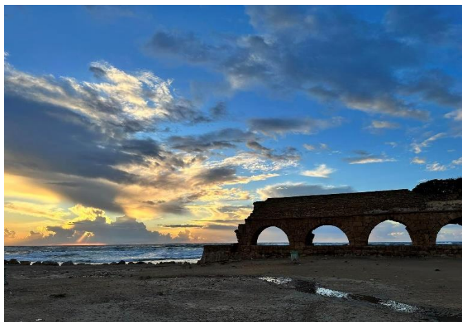
Herodian Aqueduct at Caesarea Maritima

After arriving at Ben Gurion Airport, near Tel Aviv, Israel, you will board your luxury bus for a short drive along the Coastal Plain of Sharon to Caesarea Maritima . This maritime city was built by King Herod, and was once the seat of the Roman rule. Here, Cornelius became the first gentile to convert to Christianity. This is also the location where Paul was imprisoned before his trial in Rome. View the ruins of Herod's seaside palace and a large hippodrome where chariot races were conducted.